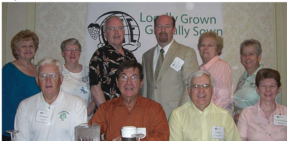
2011 Association Board Members at New England Conference Waterbury, CT - June 2011