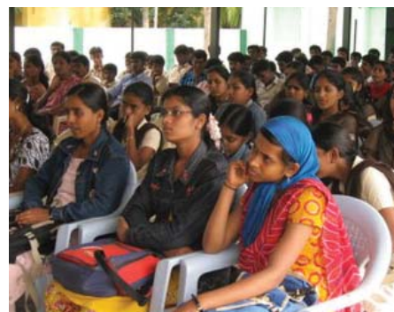
Students at the H.K. Veeranna Gowda College assembly listening intently while we answered questions about the education system in the US and what we thought about President Obama's visit to India.

The aspects of India that have not changed are the warm hospitable people; the reminders of the ancient culture and history with the temples and monuments; the contrasts of wealth and prosperity along with the poverty; the gracious and glorious Indian women in their colorful saris; the peaceful co-existence of the modern technology of transportation along with the water buffalo, bullock carts, cows and village people on the same street...maybe even traveling in the same direction; the intense and persistent entrepreneurial spirit of the wallahs/vendors/shop keepers; aromas of Indian food on the streets, restaurants and in the homes; and the joy, shyness, curiosity, wisdom and beauty in the faces of the children and young adults as we walked among them on the streets, in museums, in train stations and shopping areas. One is ever aware of the population density especially in the cities in this country of 1.3 billion people. What a joy to return and share experiences with families 43 years later and to share the ASPAC IFYE Conference with our fellow alumni.