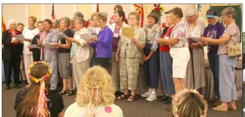
IGADs (IFYE Guild of Ancient Dames) Encore with ISLYs (IFYE Society of Ladies Young) in Awe!