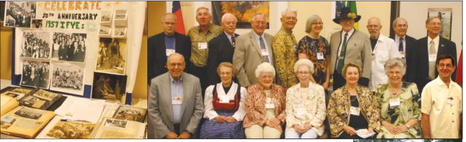
1957 50th Anniversary Conference Display