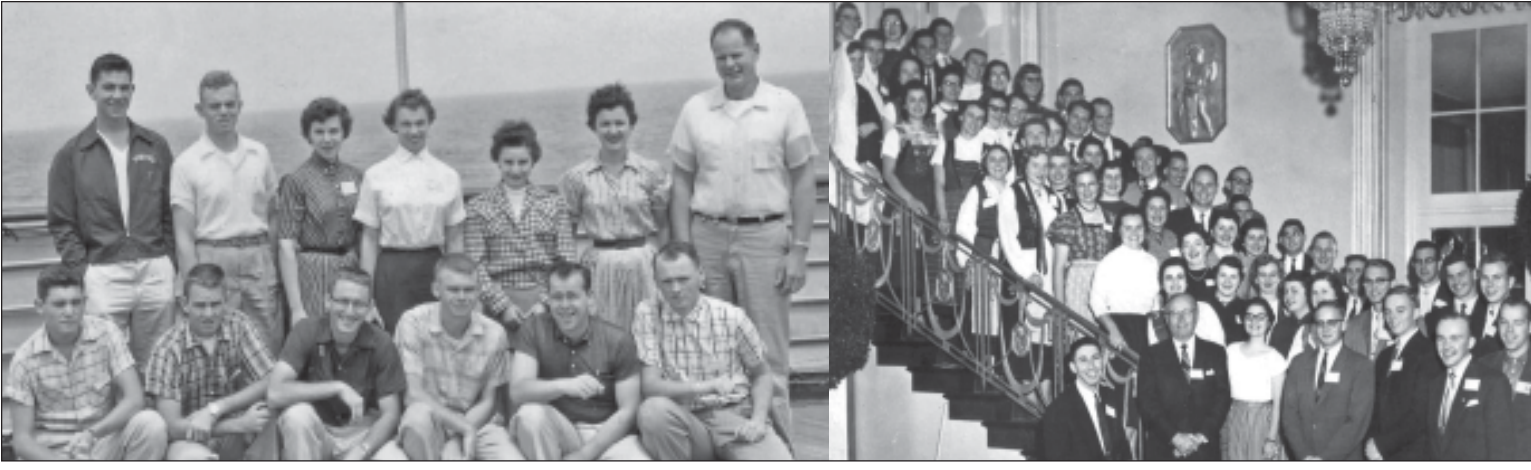
1957 Delegates Aboard the Ship Julius Caesar*