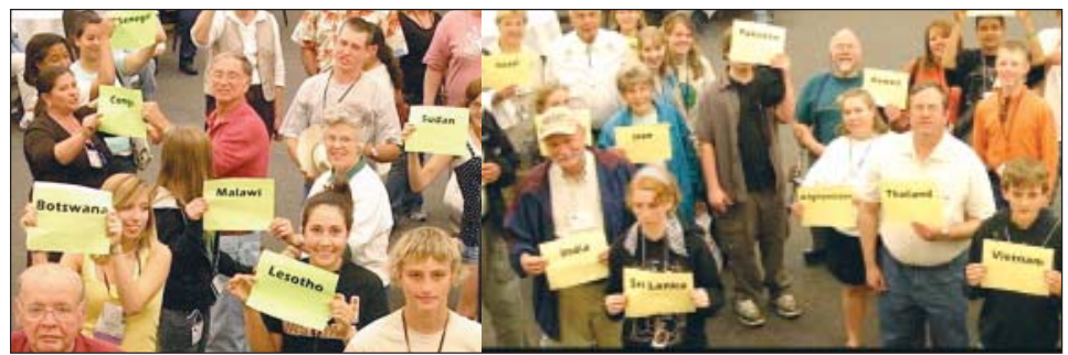
Just Where on Which Continent is this Country Located?