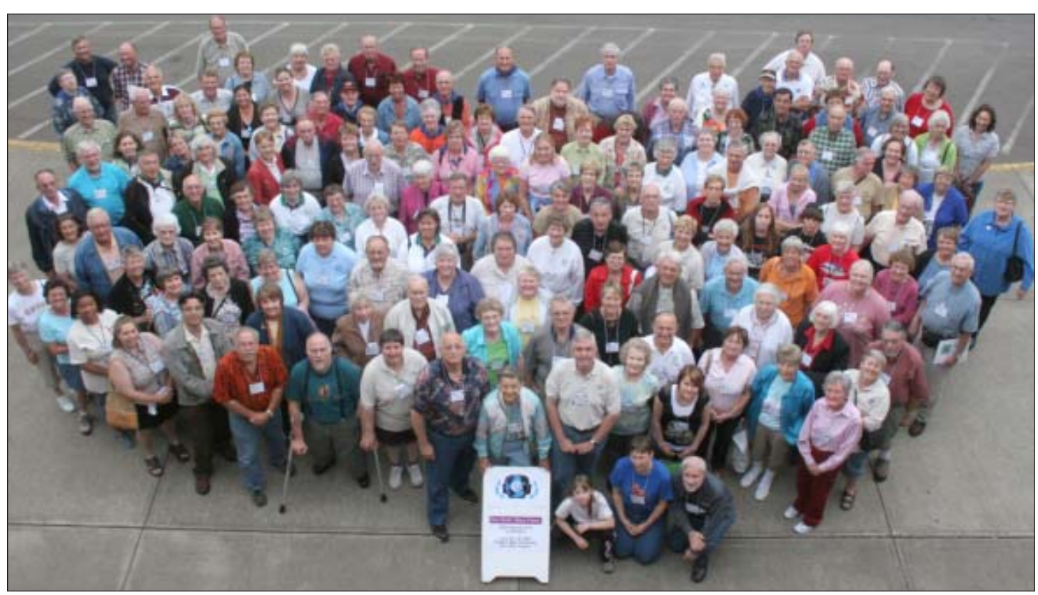
June 26-30, 2007 - National IFYE Conference - Oregon State University - Corvallis, Oregon