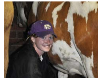
Me, milking one of my favorite cows!