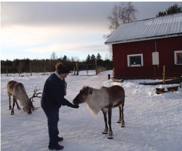
Me, taken on a visit in mid-November to a reindeer farm in Ruhtinansalmi (northern Finland).