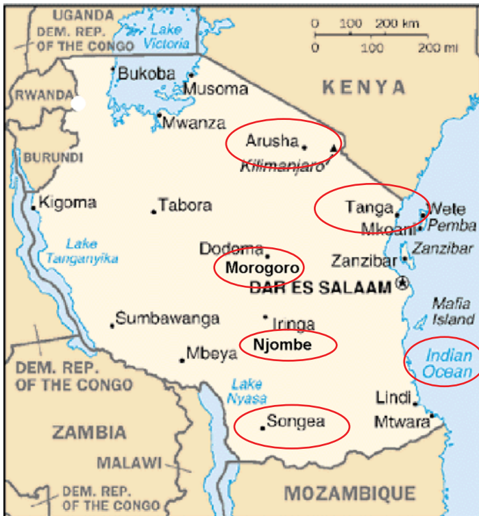
Adaptation of http://0.tqn.com/d/geography/1/0/4/3/1/TanzaniaMap.gif

I traveled from the plains of Arusha to the mountains of Songea. I've been on the coast of the Indian Ocean and the highlands of Njombe. I can tell you, assuredly, that these success stories are everywhere; the more I looked, the more it reminded me of home. The remote highlands of Wino brought to mind Folsom, NM. The oakbrush (or something like it) combined with the rugged landscape brought back memories of another region as desolate and rugged as anywhere in East Africa. The flatlands of Arusha with hills on the horizon brought to mind the town of Fort Collins, CO where I had gone to a few 4-H conventions. Tanga and Morogoro became, instead, College Station and Houston in my mind's eye.