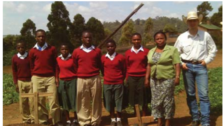
Me (far right) with the 4-H advisor and club members from Livingston School in Njombe

Now, I'm laying the poeticism on pretty thick because my next point is that the people that inhabit these familiar-looking places (minus the banana trees) are not so different from any Americans I've ever met.