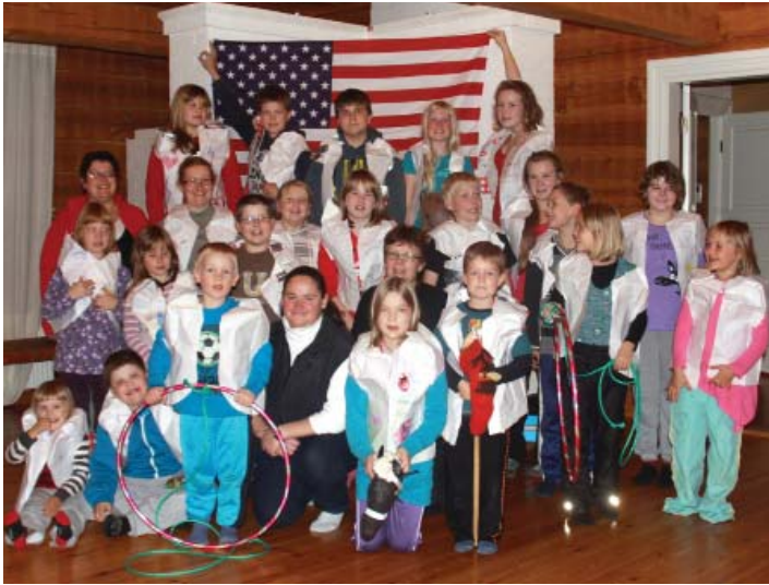
The children from this 4-H club in Finland were interested in learning of some American traditions, such as rodeo. I taught the kids the basics of rodeo and then we had a stick horse rodeo competition. After the awards ceremony for the winners (no gold buckles just yet... only candy!!!), we took this photo. (I am kneeling in the middle of the front row.)

My time abroad via the IFYE program will be ending in December and the experience has been great! Germany and Finland have both offered endless opportunities to learn of the culture, traditions, landscape, and people. I have been incredibly humbled by the immediate and warm welcome of IFYEs and IFYE hosts. I feel as though “IFYE” is an international code word for the greatest hospitality a person could ever experience and great friendships.