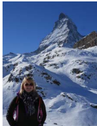
Me, in front of the Matterhorn

My six-month IFYE exchange was split between three countries of the United Kingdom (Scotland, N. Ireland, and Wales) and Switzerland. The UK and Switzerland were two incredibly different experiences and I am very pleased to have had them both.