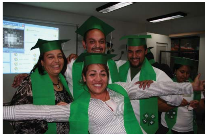
Happy graduates in Salvatierra after finishing 4-H teacher training