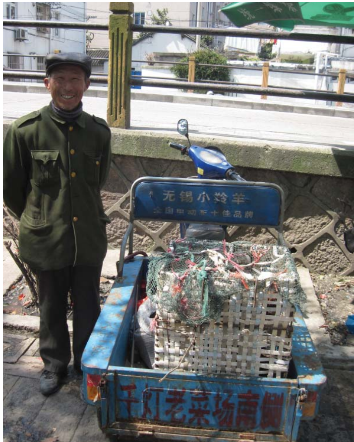
Farmer who spoke English to us near Shanghai, China (April 1-7, 2012)