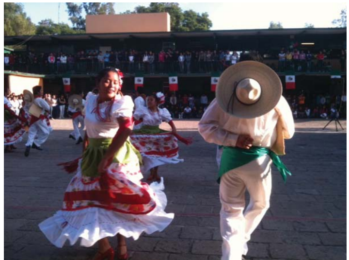
Dance students in Irapuato celebrating Mexican Independence on September 16 th , 2011