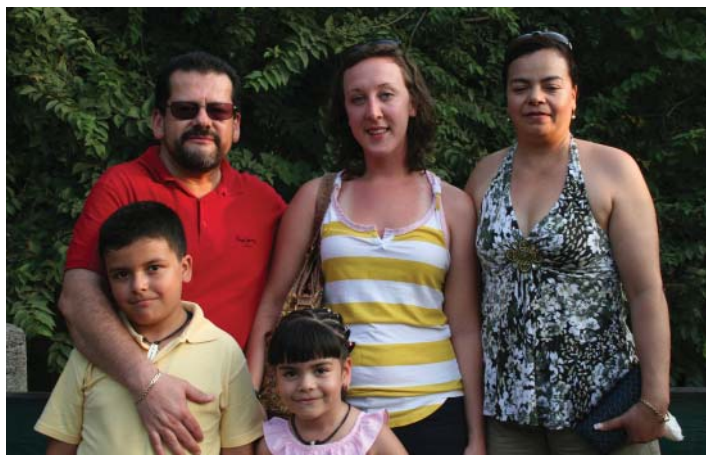
One of my host families and me (center) at the beach in Ixtapa.

For the most part, my host parents in each city worked in the school system as teachers or principals. Daily, I traveled with them to school and spent time learning about the educational system and sometimes attending classes. Living with these families, I also became accustomed to Mexican culture by attending family events and holiday celebrations.