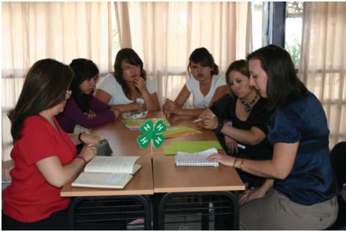
4-H students and teacher planning their community service project - I am on the far right.

In the morning, the 4-H students presented their community service projects and received feedback from WVU and UG faculty. The projects, which were all created and designed by high school 4-Hers, included revitalizing an abandoned school orchard, providing training in science and technology to elementary students, spending time with and caring for the elderly, and starting community soccer teams for young kids. At the end of the day, all the students and teachers participated in five educational workshops or "Skill-a-thons" that focused on teamwork, communication, leadership, nutrition, and entrepreneurship. Preparing for this event was probably the most difficult and time-intensive of my experiences in Mexico. However, seeing the excitement and progress of all the teachers and students was incredibly rewarding.