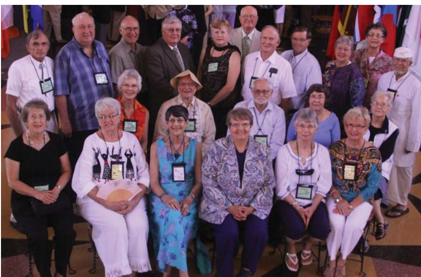
Twenty-two IFYE alumni from 1962 were able to attend the 2012 Conference International Banquet (several meeting at conference for the first time since their IFYE experience).