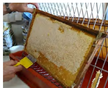
Removing honey from combs

To remove the honey from the combs, we used a metal-pronged scraper to open the honeycomb. Then, we put the racks into a machine that spun the comb around to remove the honey without destroying the honeycomb. After the honey was extracted by centrifugal force, we gave the honeycomb back to the bees to fill again. Since it was the last gathering of the season, the bees won't fill the combs until spring. Also, you need to give the bees sugar water as food when the season is over.