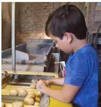
Taking out bad potatoes

My fourth family sells potatoes directly from their farm. They have 200 acres of sugar beets, wheat, canola, and potatoes. I helped in the field cultivating, as well as harvesting and bagging the potatoes.