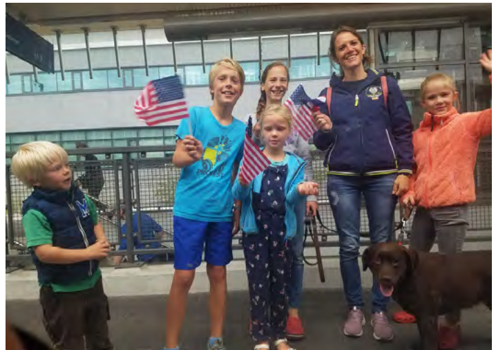
Auf Wiedersehen - I'll see you later!

My third host family raises 4,500 finishing hogs, and grow wheat, barley, and corn on 400 acres. All the crops are produced to feed the hogs. They also produce renewable energy through photovoltaic systems and have five wind turbines. They have four children; so, I helped with them most of the time. However, I did work with the hogs a few days and in the field.