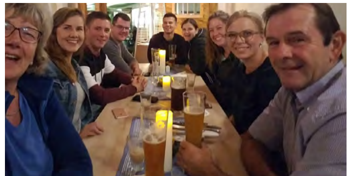
I was able to re-visit my first host family during my free time between countries. So glad I got to visit again

My first host family has 740 acres of wheat, canola, barley, corn, and sugar beets. They also do some custom hay and straw for horse people. Because not much was happening in the fields at the time, I helped with the horses and mowed grass.