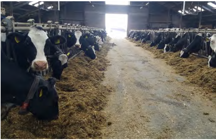
My second host family's dairy barn

My third host family raises 4,500 finishing hogs, and grow wheat, barley, and corn on 400 acres. All the crops are produced to feed the hogs. They also produce renewable energy through photovoltaic systems and have five wind turbines. They have four children; so, I helped with them most of the time. However, I did work with the hogs a few days and in the field.