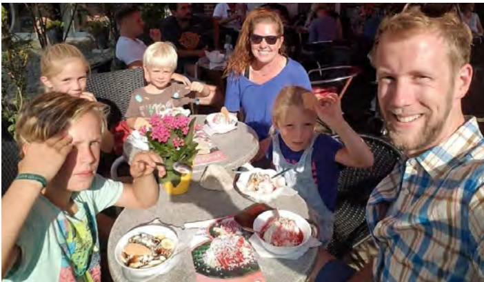
My third host family and me eating ice cream and spaghetti

But first - free time - Before leaving for Argentina, I was privileged to have my family visit me and tour a bit with me. One of the interesting farms we visited was a floating farm in Rotterdam, Netherlands!