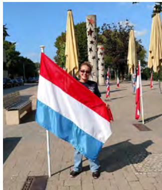
Me with Luxembourg flag