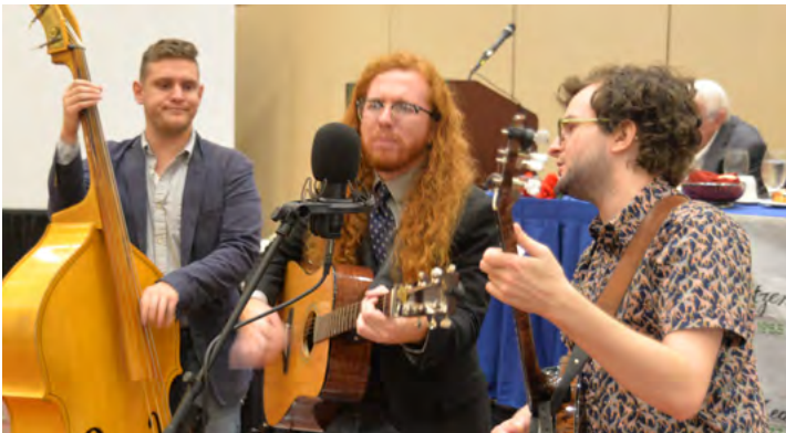
Hillhouse Band - Saturday night dinner entertainment