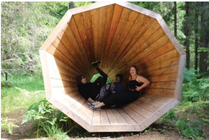
Relaxing in the "wood"(s)

In Estonia, I lived with seven families, taking on some of the day-to-day projects of gardening, rolling up electric fence, packaging sausages, serving in a café kitchen, prepping for the first day of school, teaching country western dances, and picking berries galore. With long summer days, we had time to play – exploring festivals, forests, lakes, castles, beaches and bogs.