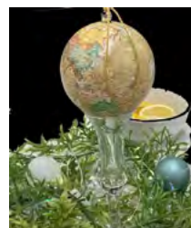
One of the table decorations created for the International Banquet .

The Missouri IFYE Alumni Association appreciates all who braved the pandemic to attend and renew friendships and make new friends! The conference would not have been possible without the help of the many IFYEs and SPIFYEs, Missouri natives, transplants, and “returnees” who displayed the IFYE spirit to make a successful conference.