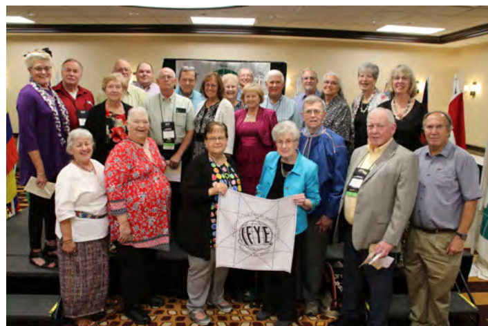
Thank you, Missouri!

Thank you and looking forward to seeing you at the 2022 conference in Normal, Illinois!