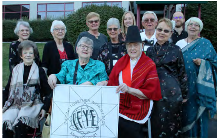
Michiganders gathering prior to the International Banquet.

was special as always. The Swiss IFYE bell was rung again and the 2021 IFYE conference was declared officially over although socializing continued in the Hospitality Rooms.