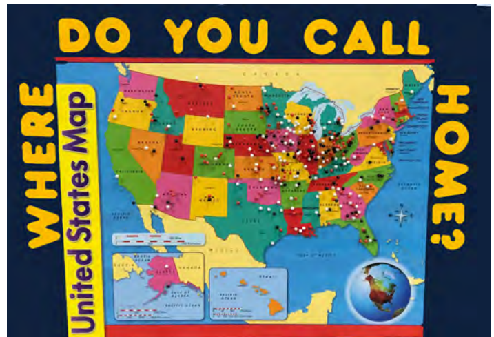
FFA members "pinned" their hometowns while learning about future "host homes."

Thank you in advance for your continued support of IFYE USA.