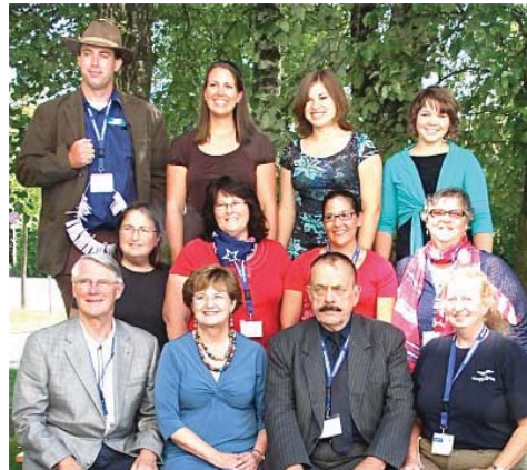
(Continued from Page 10 - “52nd European IFYE Conference)