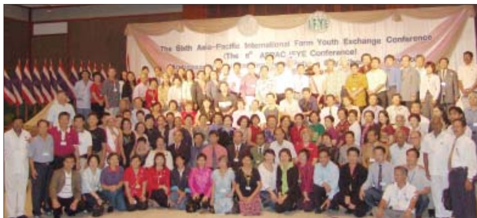
The Sixth Asia-Pacific (ASPAC) IFYE Conference was held in Pattaya City, Chonburi, Thailand, September 4-8, 2005. Over 200 alumni from nine countries attended.

Visit the website - www.ifyeusa.org - for information on tours and other conference updates. ☆