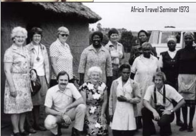
Africa Travel Seminar 1973