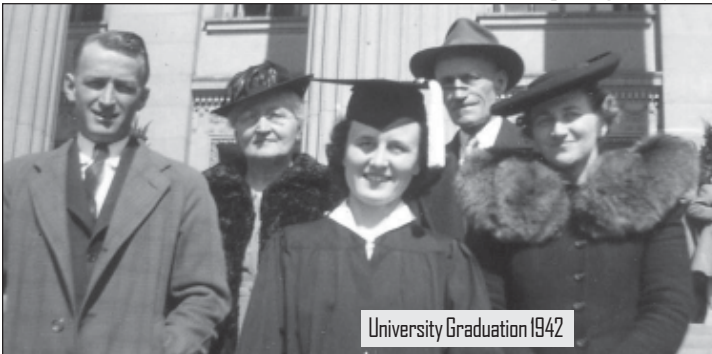
University Graduation 1942