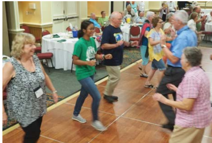
Line dancing at the end of the conference opening ceremony