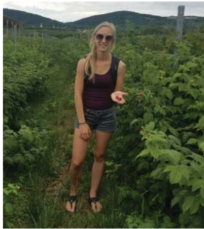
Me with fresh fruit that will be turned into juice on the Altenriederer fields. They make every kind of fruit juice you can think of, as well as a variety of wines.

Most importantly, I've learned how essential it is to accept the differences you share with people and respect these variations. Although people may eat different foods than you, have different jobs than you, and drink water with no ice, there is no such thing as the wrong way. Asking questions to understand your differences before making judgments can get you a long way. The list of things I've learned so far is endless as well as the impact they've had on me.