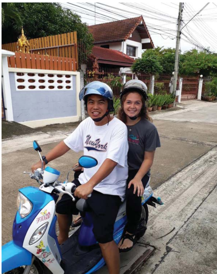
My favorite way to travel in Thailand!

In my first few days in Thailand, I was introduced to the IFYE Thailand team and given an amazing welcome. These people are some of the kindest I have ever met; they do so much for the IFYE program and the delegates that travel here.