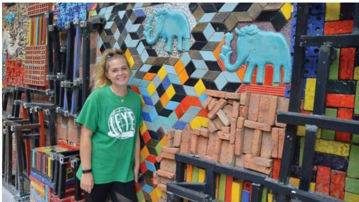
One of the colorful scenes I've observed in Thailand

There are also so many vibrant colors: The buildings are blue, green, pink, orange ... Advertisements and signs ... Street carts with their umbrellas, cars and motorcycles - all different colors. It's such a contrast from anything I've ever experienced.