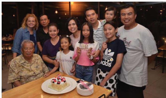
My favorite part of my time was spending it with my host family