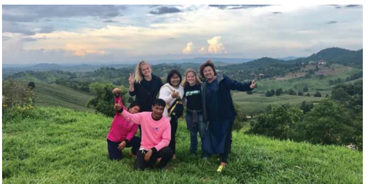
A great way to spend our last night in this area of Thailand