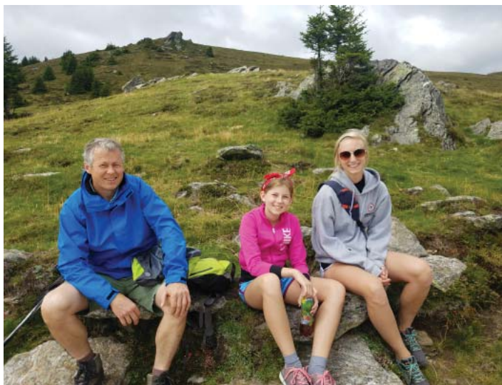
Part of my host family (L) and me (R) taking a short break on our hike to a mountain alm

I toured the Zotter Chocolate factory ( https://www.zotter.at/en/homepage.html ) with another host family; this is one of the most sustainable Austrian companies. I learned that their company buys all of their cocoa and sugar cane organic and from Fair Trade. Yes, this means their products are a little more expensive but it gives farming families in third world countries a chance to live with a little less stress due to proper wages as well as helping to prevent child labor and harsh working conditions. This also means you can buy as much chocolate as you want without feeling guilty! During the tour I learned about how chocolate is made here in Austria and what it tastes like every step of the way. I probably ate my weight in chocolate here since they had every flavor imaginable! At the Zotter Chocolate Factory, I learned how important it is and how much of a difference you can make across the world if you support Fair Trade. ( http://www.fairtradefederation.org/what-is-fair-trade/ )