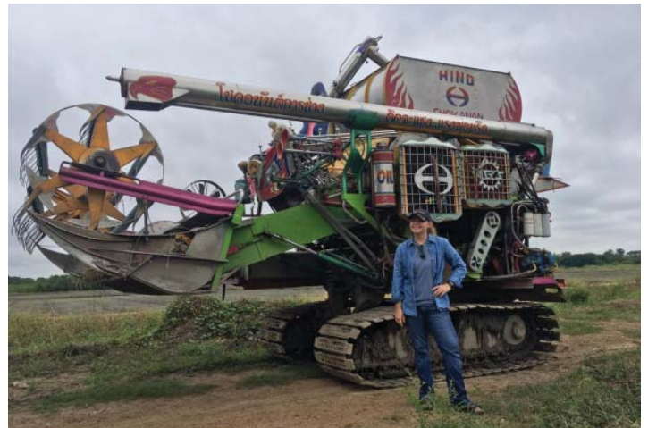
A Thai combine

I am excited to see what the rest of our time here in Thailand brings and am so thankful for this opportunity to learn about this amazing country.