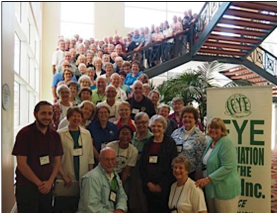
2017 Conference Attendees