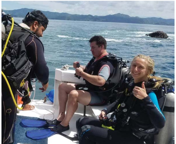
Practicing diving after taking a basics course

Fun fact of the day: Sloths have a four-part stomach so it can take up to a month for them to digest a meal, which means it has very little energy left to move around making it one of the slowest moving animals in the world. @ Quepos, Costa Rica