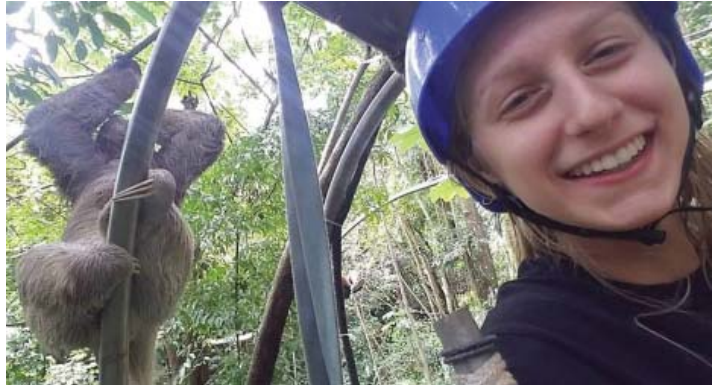
Excerpt from Facebook post (October 16, 2017): I got to take a selfie and become friends with a sloth today

Fun fact of the day: Sloths have a four-part stomach so it can take up to a month for them to digest a meal, which means it has very little energy left to move around making it one of the slowest moving animals in the world. @ Quepos, Costa Rica