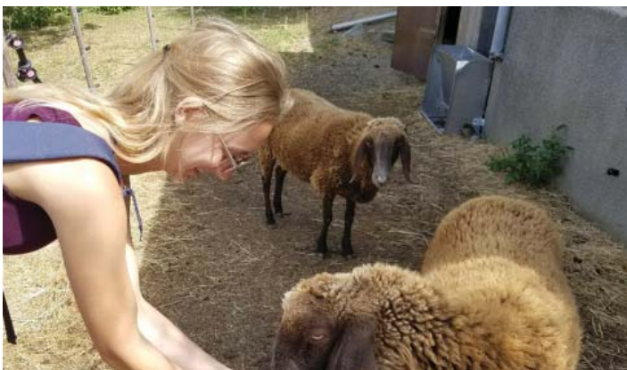
Feeding the sheep

I can't wait to see what the rest of my time here in Austria and my three months in Costa Rica brings to me.