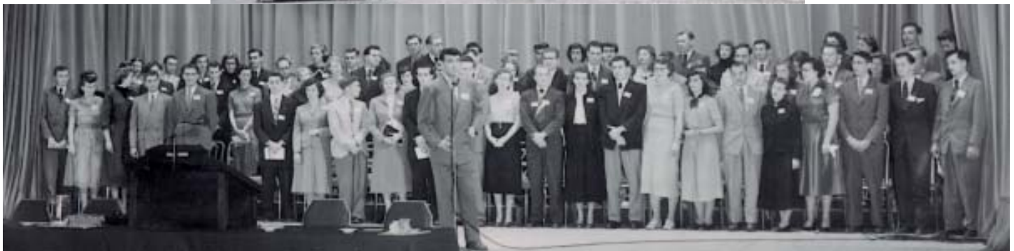
Celebrating 50 Years! The 1953 U.S. IFYE delegation included 116 participants representing 44 states. They were hosted by 38 countries. The call "Attencione!" became very familiar to the first summer group to depart (top) as it preceded every announcement aboard the Italian ship "Conte Biancamano," on which they traveled. They were on the high seas for eleven-sixteen days depending on their destination - Switzerland or Middle Eastern countries. All 1953 delegates returning in the late fall that year (above) were hosted in New York City by the Grocer Manufacturers of America before continuing on to Washington, D.C., for their consultation/evaluation program.