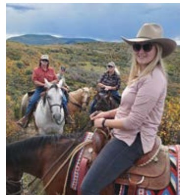
Enjoying Colorado's scenery