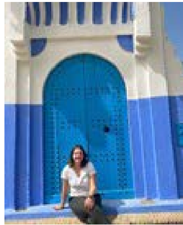
Chefchaouen - The Blue Pearl, exceeded my expectations

“Looking back, my time in Morocco was not an easy one, but it was an immense time for learning and personal growth. I learned to trust in myself and practice resiliency. ... I am very grateful for the time I spent in Morocco and will look back at my time with fond memories and lots of laughs.”