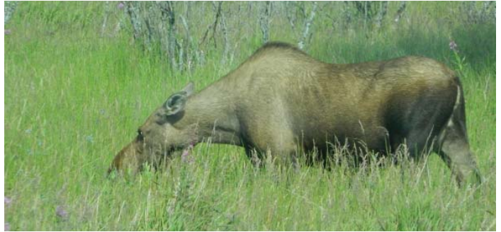
Moose on the road to Kenai River

of animals like caribou, bears, moose, and Dall sheep. The day was clear so we got to see Mt. McKinley. I have taken a bath at Manley Hot Springs while watching grapes hanging from the roof. See more about Dall Sheep at http://www.adfg.alaska.gov/index.cfm?adfg=sheephunting.main