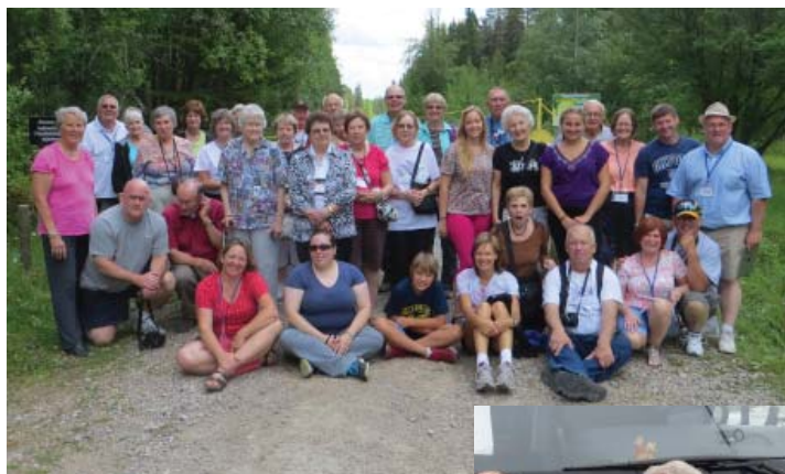
Above: 2014 tour group in Raate, Finland

Organizing tours to Finland and sharing experiences have been my way of continuing the IFYE mission of promoting international understanding and at the same time promoting a country that is engrained deep in my heart— thanks to IFYE.