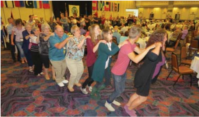
Conferees "wind" around the room at one of the meals!