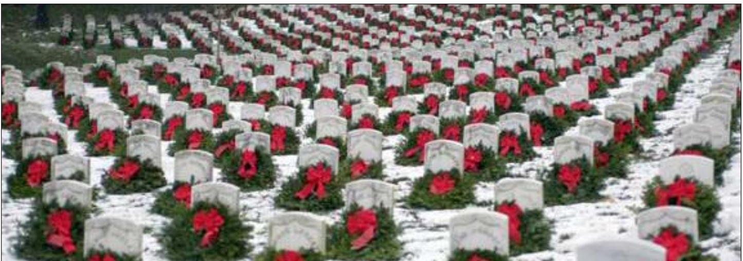
Christmas at Arlington Cemetery (See Page 3) - In Honor and In Memory!