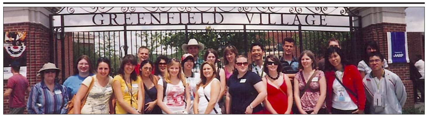
2008 U.S. IFYE Delegates and Inbound IFYE Exchangees - Orientation in Michigan

A challenge to all involved with 4-H: An Image of Excellence includes an International Dimension! 🛠