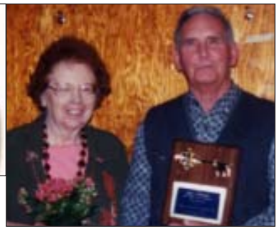
Citizens of the Year

He participated in a 1989 People-to-People program to the USSR.