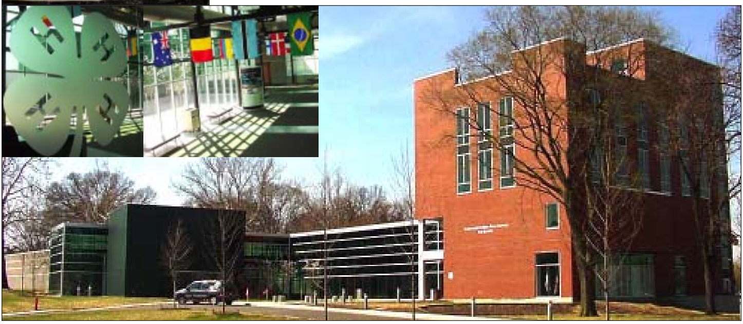
Nationwide and Ohio Farm Bureau 4-H Center at Ohio State University