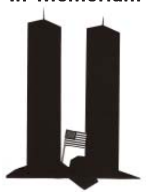
11 September 2001 The WTC Towers A Pennsylvania Field The Pentagon