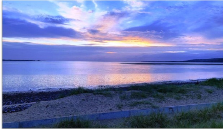
Llanelli - Wales

pictures. I'm looking forward again when it's Wales or Northern Ireland. It will probably not be my last visit to Llanelli and Donegal. I am planning another visit before Christmas and there will be a few in 2023 too. So, if anyone would like to meet me, just get in touch and we can go for a drink or a dinner if my work schedule allows.