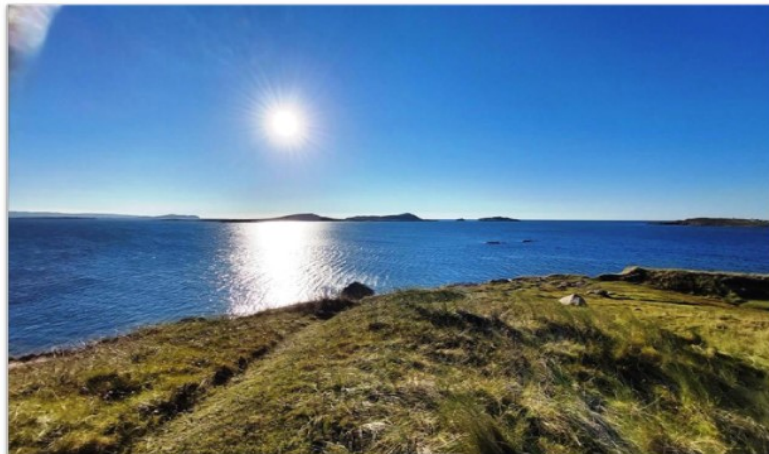
Donegal - Ireland

We are also living with the Covid-19 pandemic and have learned to understand the virus better and better and how to live with it. I hope you are all well and see you in the best possible health next year in Velden am Wörthersee at the 63rd European and 12th World Conference.