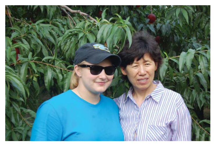
One of my host mothers (right) and me