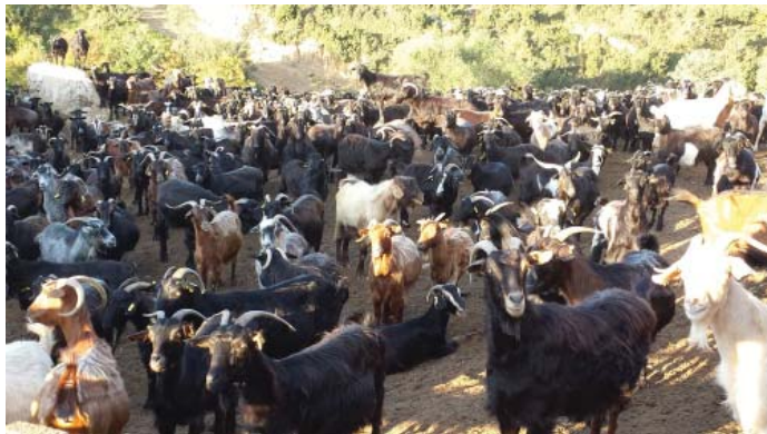
One weekend, I visited a family farm that had 1,000 milking goats! Boy, was I impressed! (The milk is used to make feta cheese.)

The people of Greece tend to have a very giving culture. On students' name days and birthdays, they would bring in candies to give away and not expect to be given a gift. Additionally, Greeks eat later in the day than the average American. Their dinner time is usually after 8 pm and can sometimes be as late as 10 pm. Many shops will close from 3-7 pm and then be open from 7 pm-12 am or later. So, if you are planning on going out in Greece, you will be the only one out if it's before 10 pm, and be prepared to stay out late into the night or early into the morning. Many of the bars and clubs do not close till 5am or later. Greeks often will go out to