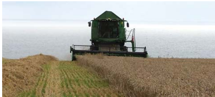
My last stop in the UK was in Newton Ferrets, County Devon, England where I stayed with a lovely family that farmed right down to the sea! Shown here - Combining the wheat.