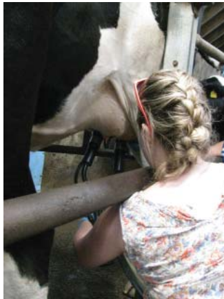
Me - helping with milking

During my last week in Scotland, I was hosted by the Lothian and Peebles district who placed me in three different homes throughout the week. For the first night in the district, I stayed in a flat in Edinburgh with a member of the Edinburgh Young Farmers Club; I used my time with her resting and catching up on life back home. After Edinburgh, I stayed on a dairy farm owned by a family with three daughters the Bathgate Young Farmers Club. With this family, I was able to help out on two different farms with basic farm tasks and milking cows. My host family also took me on a car treasure hunt hosted by their club.