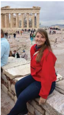
Me at the Acropolis in Athens, Greece

After graduating from Montana State University in May of 2014 with a BS in Animal Science, the next adventure in store for me was to travel for 6 months with the IFYE program to the United Kingdom and Greece. I stepped onto the plane in June, not sure what to expect at my first destination (Edinburgh, Scotland). When I stepped off the plane in December, back in the USA, the past 6 months had been an experience of a lifetime!