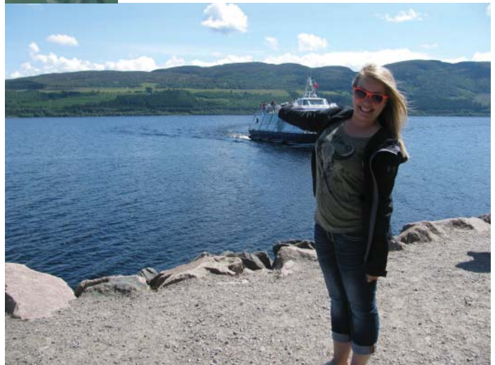
Me at Loch Ness searching for “Nessie”

Our next host(s) had other things planned including sheep shearing, a fruit farm tour, shopping, an organic carrot and chicken farm tour, and a local show dance. It was in this district that I developed a deeper appreciation for my own culture. One of my host families was extremely knowledgeable about Scottish history, so when learning about the Wars of Independence in the 14th century, I came to realize how fortunate I am to have been raised in such a strong, proud, independent country that is known for its leadership and diversity.