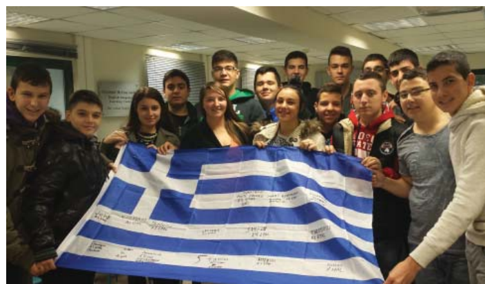
One of the classes in which I helped teach English as a second language at the American farm school - I am center to right of cross on the flag.

The American Farm School - http://afs.edu.gr - in Thessaloniki, Greece is one of the only boarding schools in Greece that has a farm aspect. At the American Farm School, you will find a high quality dairy cow facility along with poultry barns, vineyards, and