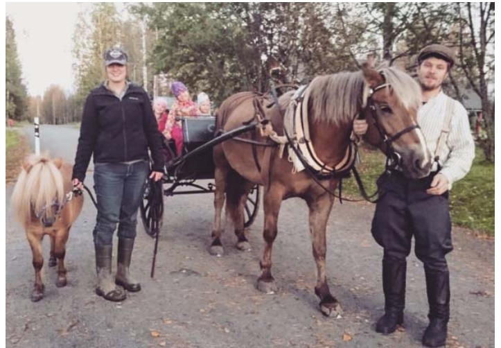
My last evening we hooked up Roksu to a traditional carriage and drove him around for a bit with the pony in tow. My host dad even wore traditional clothes!

a childhood dream come true and I really loved helping out. My favorite parts were giving the polar bears breakfast and seeing these giants up close, and holding baby beavers so they could get their medicine. I also helped clean the pens of the minks and weasel, and then feed the brown bear, beavers, cranes, dholes, otter, grey-sided vole, foxes, and wild boars. It was so exciting to have this once in a lifetime experience and be up close to these animals, and I have to thank my host family so much for giving me the opportunity. ... I didn't take any pictures because I wanted to be in the moment and actually help with the work instead of stand back and take pictures, but I have a lot of memories to keep with me in my mind.