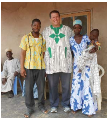
Ghana - 2014

In addition to learning so much in Taiwan (adapting to an "Eastern culture" and ways of looking at the world, learning some Mandarin Chinese, and experiencing new foods), I also had three weeks of free time at the end of the program. I used part of that time to travel to Mainland China on my own.