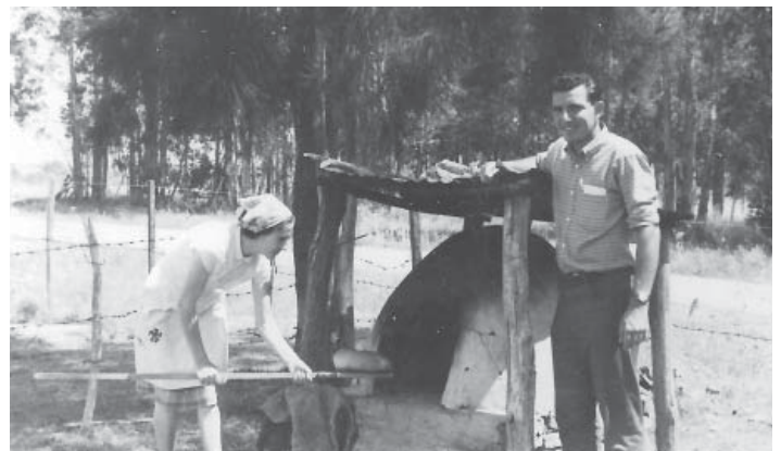
September 1966 - Helping Mrs. Ayala bake bread in Egana, Soriano