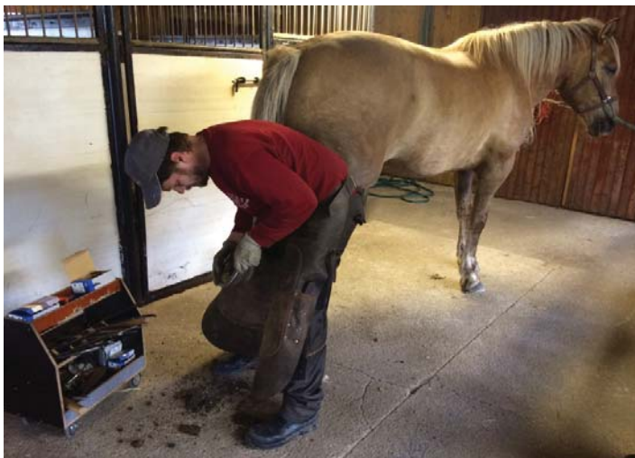
My host father shoes horses as a side job so I went along with him to watch him work. I've learned about shoeing and all the tools used in my equine classes at OSU so it was neat to see that the process is pretty much the same here.

I've noticed a lot of people in Finland can knit some really nice things like sweaters and cozy socks. I mentioned that I wished I had learned to knit, so my host mom promptly sat me down and started me on my own knitting. It's not as hard as I thought it looked, but then I was doing the simplest version too. I think it would be nice to learn how to knit really well when I'm back in the U.S. as a hobby.