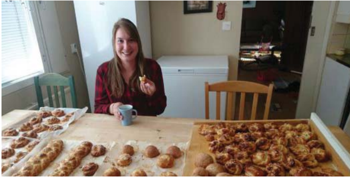
I loved enjoying a cup of coffee and tasting all the different kinds of pulla (a traditional Finnish bread tasting a little like a cinnamon roll)!

I am leaving Finland and it really is bittersweet. I have enjoyed my time here so much and have made friends and family for life. I can't thank my host families enough for giving me new opportunities, especially some of the ones I've had this week.