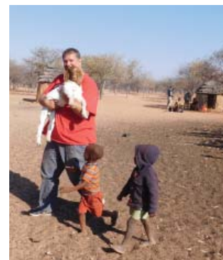
Helping with the goats in Namibia