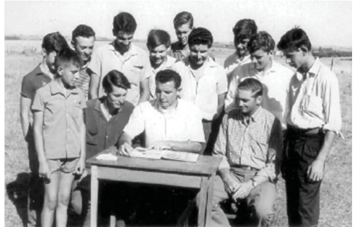
Seated, February 1967 - I show members of the Costas de Rosario, Colonia Movimiento de la Juventud Agraria club photos of my home and farm in Minnesota