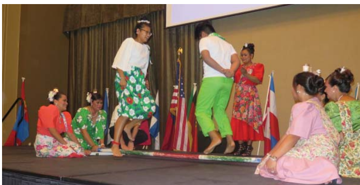
Junction City Filipino Dancers perform - Friday evening