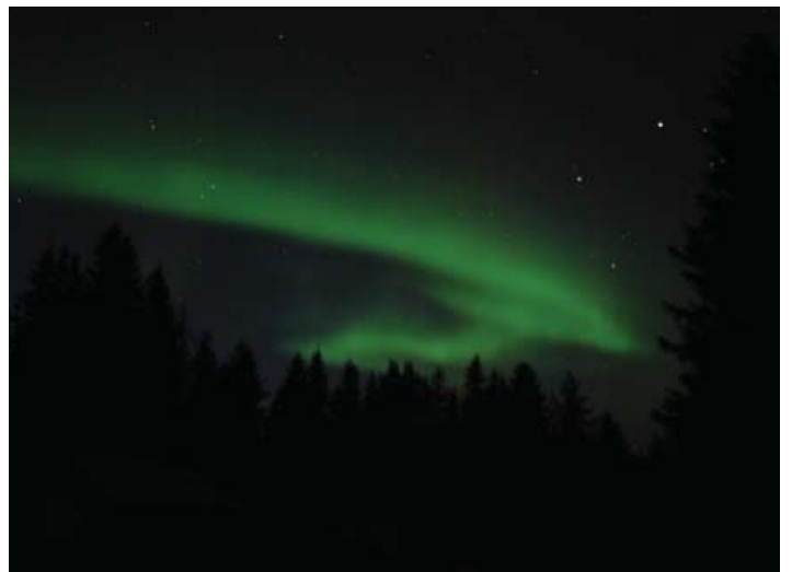
The Northern lights

Even though it's sad to leave Finland and all the awesome people I've met, I have to say I am so excited to be meeting up with my brothers in a few hours in Munich and then exploring Germany with them. And then (after a quick pit stop in Newark, New Jersey) it's off to Costa Rica!