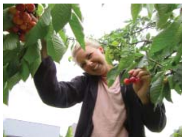
Picking cherries at the Feyder family in Luxembourg

Excerpt from Facebook: September 18 at 1:23pm · (after arrival in Costa Rica for 2nd half of IFYE program)