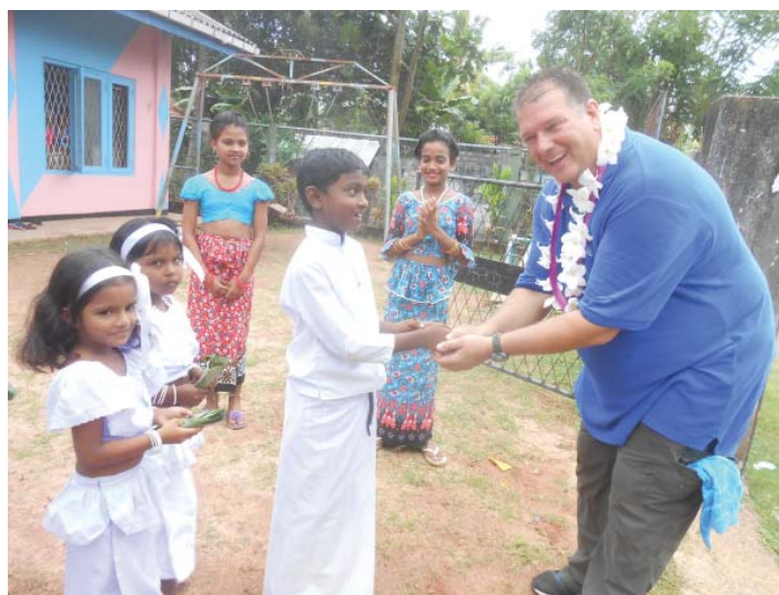
Visiting a school in Sri Lanka - 2015