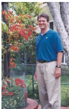
"Close" to what I looked like when an IFYE in 1991

Before IFYE, I had international experiences in Costa Rica, Venezuela, and Colombia. I figured my life was headed toward working in some Spanish-speaking country. When I applied to IFYE, I listed Spanish-speaking countries as my first choice.