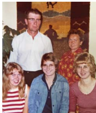
With my family in eastern Finland - (wearing my tie-dyed hip hugger bell bottom safari suit!)

of public speaking. In fact, when I returned home, the first time I spoke to a group of Nebraska county agents, I fainted dead away. In spite of that, many of them still invited me to speak to their 4-H gatherings. And I discovered I loved sharing my IFYE stories and pictures. In fact, I shared a few with friends just last night.