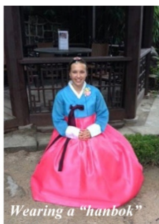
Wearing a "hanbok"