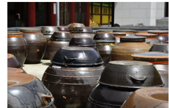
Kimchi pots - 40 lbs. of kimchi (spicy and fermented seasoned cabbage of which there are more than 250 kinds) is consumed annually by the average Korean.

The Korean alphabet, known as Hangul , has been used to write the Korean language since the 15th century. Rachel Manning (2016 IFYE to South Korea and Thailand) found it a simple alphabet to learn as a foreigner and indicates that there were some similarities to the English language. She says she also learned enough Korean language to feel comfortable while traveling and to anticipate the usual questions she would be asked.