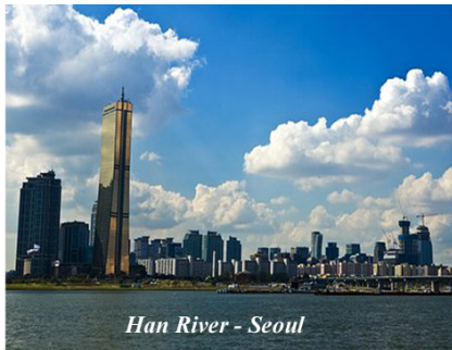
Han River - Seoul