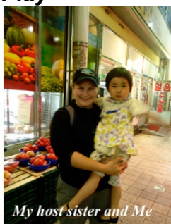
My host sister and Me