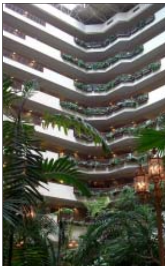
Embassy Suites Atrium

Thailand - Dates and Location to be Announced ☆