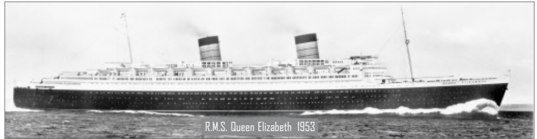
R.M.S. Queen Elizabeth 1953