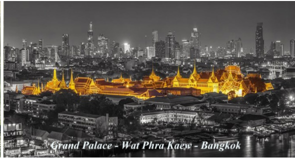
Grand Palace - Wat Phra Kaew - Bangkok