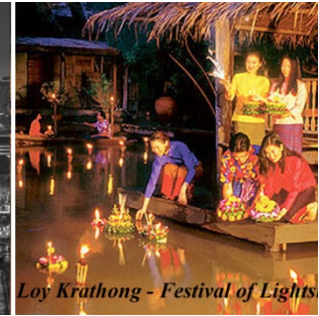
Loy Krathong - Festival of Lights