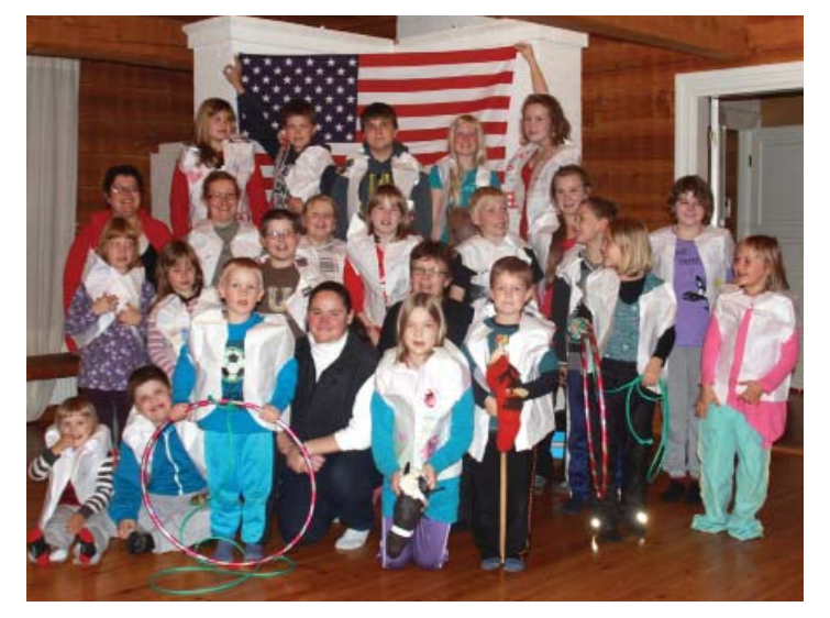
The children from this 4-H club in Finland were interested in learning of some American traditions, such as rodeo. I taught the kids the basics of rodeo and then we had a stick horse rodeo competition. After the awards ceremony for the winners (no gold buckles just yet...only candy!!!), we took this photo. (I am kneeling in the middle of the front row.)

My time abroad via the IFYE program will be ending in December and the experience has been great! Germany and Finland have both offered endless opportunities to learn of the culture, traditions, landscape, and people. I have been incredibly humbled by the immediate and warm welcome of IFYEs and IFYE hosts. I feel as though "IFYE" is an international code word for the greatest hospitality a person could ever experience and great friendships.