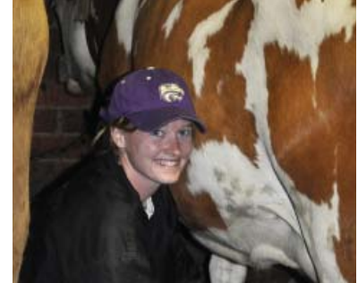
Me, milking one of my favorite cows!