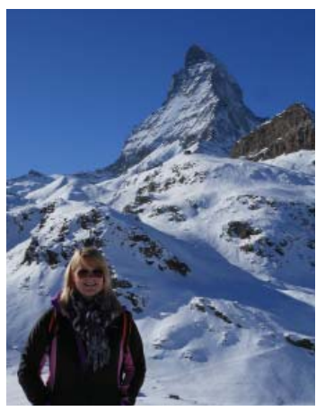
Me, in front of the Matterhorn

My six-month IFYE exchange was split between three countries of the United Kingdom (Scotland, N. Ireland, and Wales) and Switzerland. The UK and Switzerland were two incredibly different experiences and I am very pleased to have had them both.