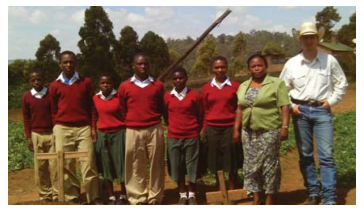
Me (far right) with the 4-H advisor and club members from Livingston School in Njombe

Adaptation of http://0.tqn.com/d/geography/1/0/4/3/1/ TanzaniaMap.gif