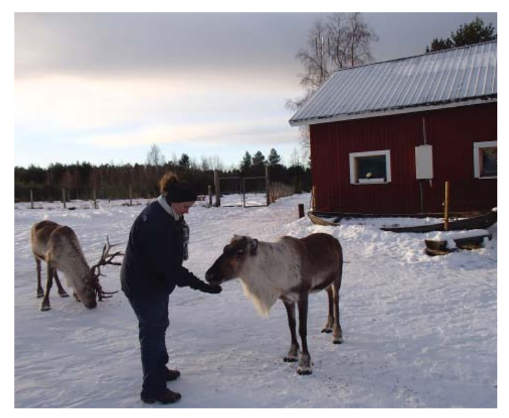
Me, taken on a visit in mid-November to a reindeer farm in Ruhtinansalmi (northern Finland).