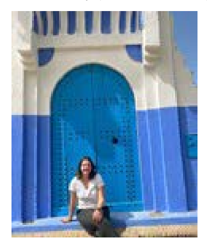
Chefchaouen - The Blue Pearl, exceeded my expectations

"Looking back, my time in Morocco was not an easy one, but it was an immense time for learning and personal growth. I learned to trust in myself and practice resiliency. ... I am very grateful for the time I spent in Morocco and will look back at my time with fond memories and lots of laughs."