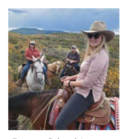
Enjoying Colorado's scenery