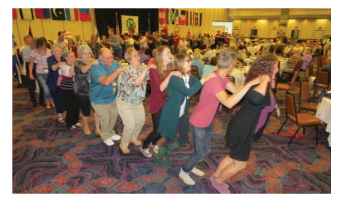
Conferees "wind" around the room at one of the meals!