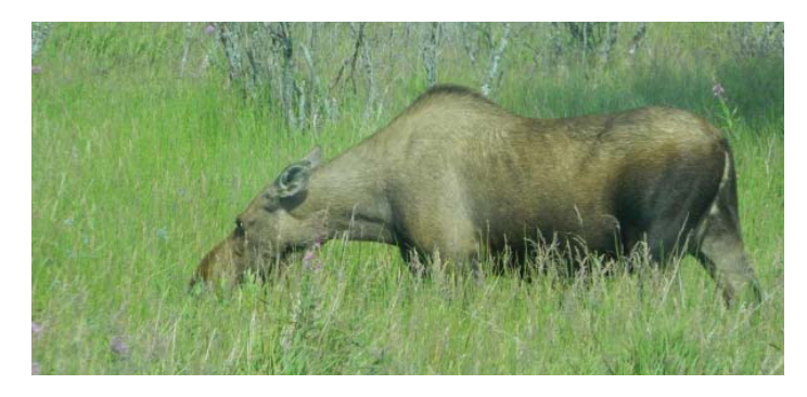
Moose on the road to Kenai River

of animals like caribou, bears, moose, and Dall sheep. The day was clear so we got to see Mt. McKinley. I have taken a bath at Manley Hot Springs while watching grapes hanging from the roof. See more about Dall Sheep at <u>http://www.</u>adfg.alaska.gov/index.cfm?adfg=sheephunting.main